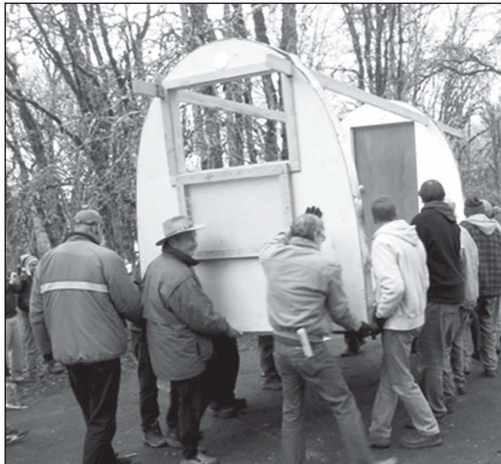
Volunteers help construct Conestoga Huts at local churches.