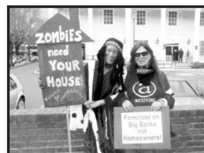
Occupy zombies prepare to protest at Bank of America.