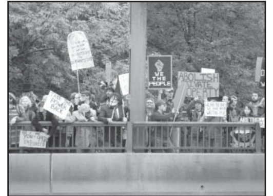
Protestors take over the Ferry Street Bridge.