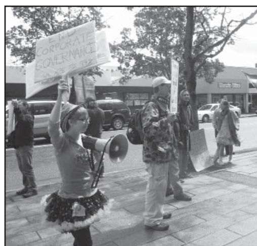
Occupy members protest at Chase Bank on May Day.