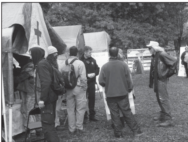
Occupiers and police officer near the Med Tent at Washington-Jefferson Park.