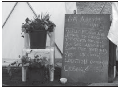
Agenda for the Nov. 11 GA at Washington-Jefferson Park.