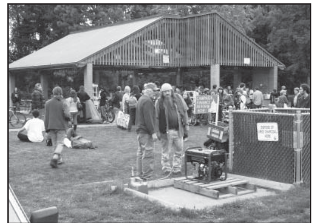
Occupiers set up camp at Alton Baker Park.