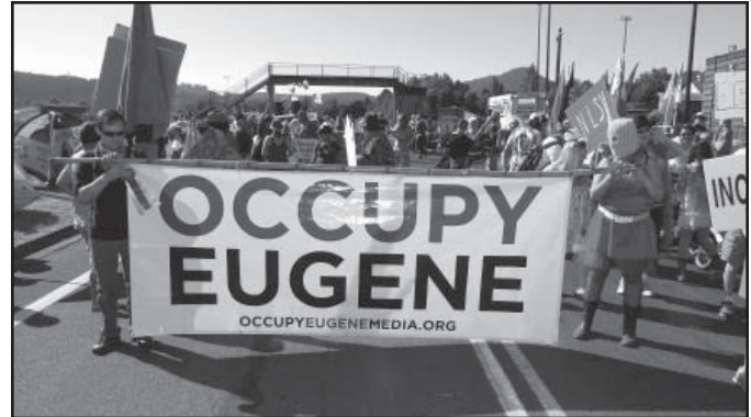
Occupy Eugene ready to march in the Eugene Celebration Parade.