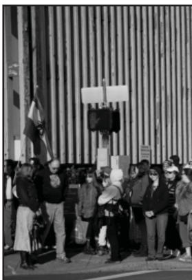
Occupy Eugene members p

22-22 Occupy Eugene a fenders sponsor Occupy