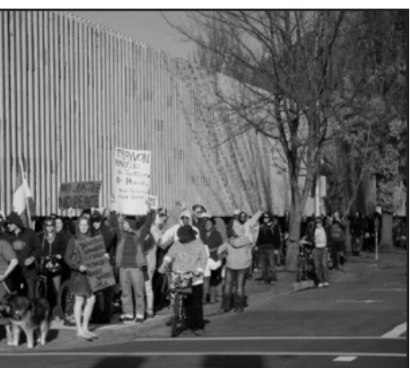
participated in A Walk with Trayvon Martin.