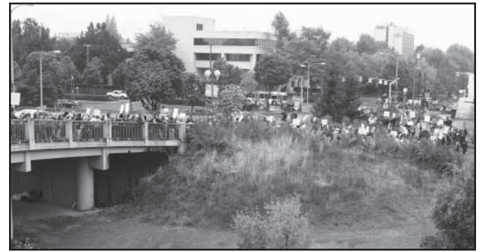
Occupiers take over the Ferry Street Bridge.