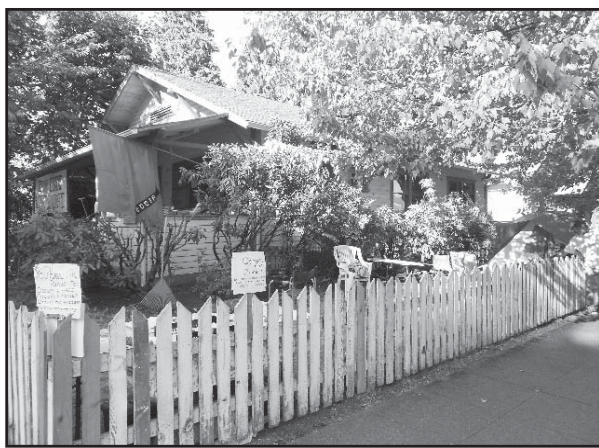
Occupy Eugene cleaned up the yard and is maintaining a 24-hour presence at 1911 Lawrence St.