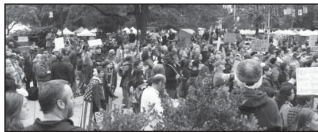
Oct. 15 rally and march.