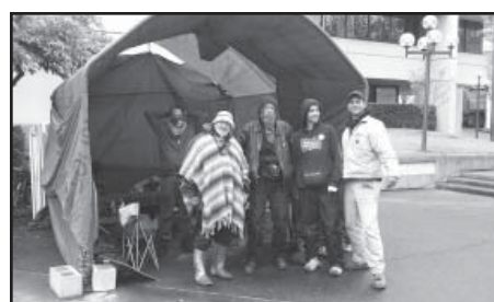
Occupy activists set up shelter in the courtyard of the old Federal Building.