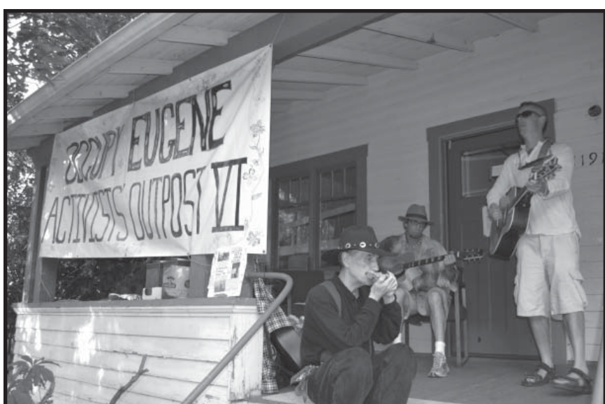
Musicians entertained visitors viewing the artwork at Outpost A.

As Dave Graeber says, "Occupy's potential beyond the encampments ... is to help dream up and live out the expression of ... self-organizational forms ... to connect [communities] ... to become a dynamic laboratory for ideas ... art can engage with politics and activists can engage with structures of art."