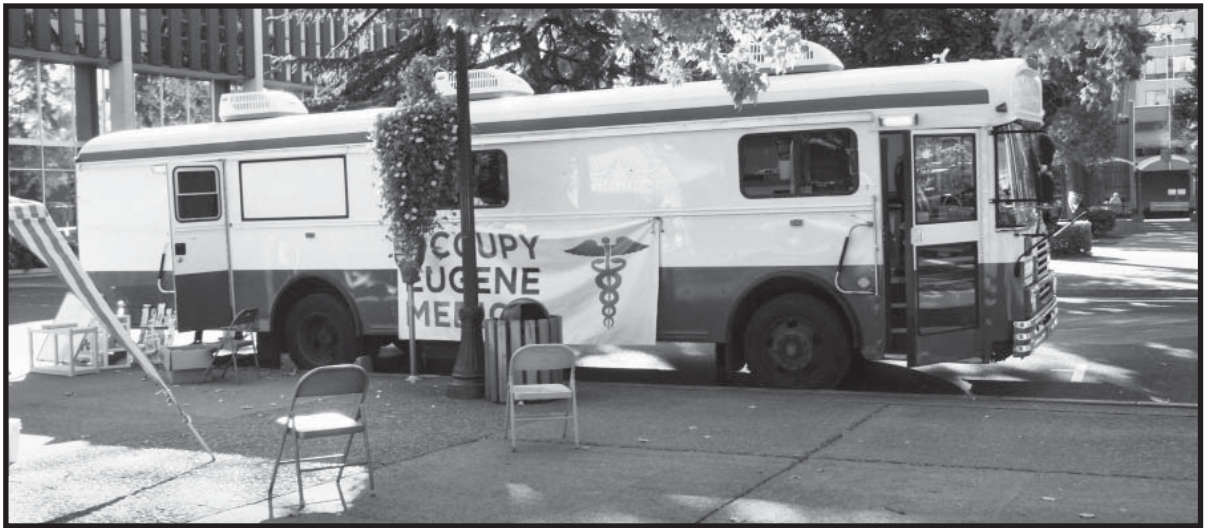
The medical bus stands at the Park Blocks, ready to offer services to all who need them.

The community has gotten used to seeing us every Sunday at the Park Blocks and now happily welcomes us. The doctors, the nurses, our many volunteers -- and especially our patients -- are very happy with our new mobile clinic. That someday is finally here. Oh, and I am no longer afraid of winter. You can read more about the Occupy Medical Clinic saga at http://occupymedics.wordpress.com .