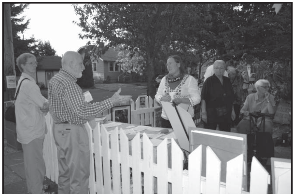
The Occupy Art and Open House event on September 7 at Outpost A.