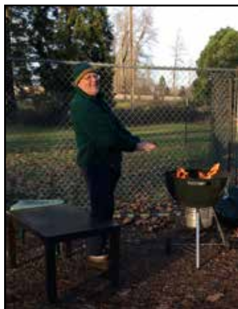
A visitor to camp warms his hands over the fire.