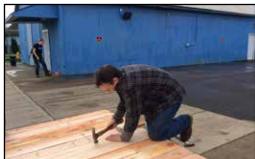
A volunteer builds tent platforms outside the CSS workshop.