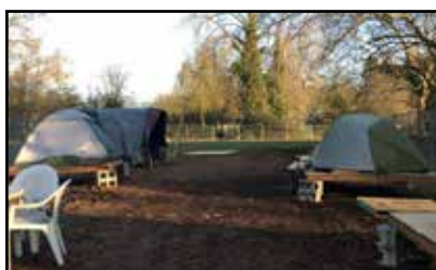
Tents catch last rays of the afternoon sun.