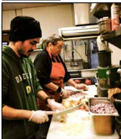
Brigade members prepare food for distribution.

We're approaching our 1st birthday as Burrito Brigade! We've grown so much this past year, it seems incredible. We can't thank all of you who have contributed to Burrito Brigade enough!