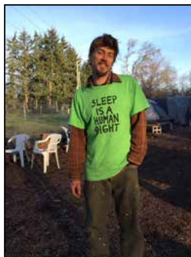
A resident of the camp shows his colors.

The rest stops have a site council that manages the day-to-day running of the camp, solving problems as they arise, making sure camp rules are followed, and holding weekly meetings in which camp issues are hashed out. The site council is backed up by a steering committee that helps fundraise and advocate for the camp. The site council can also turn to the steering committee for help in solving any larger problems that arise.