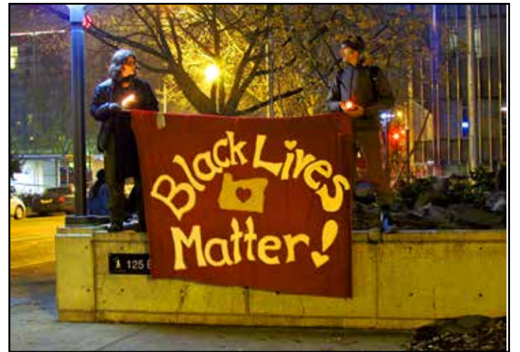
On Dec. 6 activists held the second of two vigils honoring young black men who lost their lives to police violence.

De-escalation. Doctrine and training tell officers to quickly get situations “under control,” often by raised voices, barked orders, followed all too often by violence to suppress any resistance, even simple questioning. Officers must be trained that it is far better to keep things calm, and reach their objective slowly, than to use escalation and force to get there quickly. The Eugene Police Department, to its credit, has implemented training of all of its officers in de-escalation tactics. There have been no studies undertaken, however, to see if these methods are being implemented in the field. This should be done.