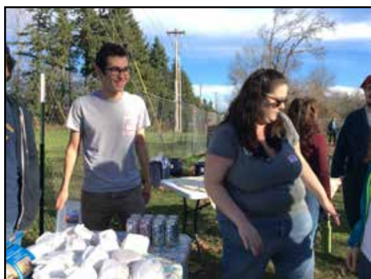
Food Love delivered hamburgers, soda and other treats to NHS during the open house