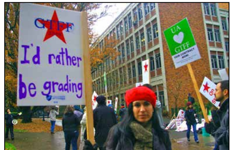
A GTF holds a sign letting her students know she’d rather be grading their work.

• The UO reported a $65 million surplus in its Education and General Fund from tuition and student fees at the beginning of this academic year, with a $4.8 million profit expected in 2015. This one-year profit