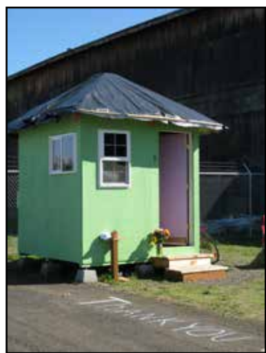
Opportunity Village here in Eugene is part of the Tiny House Movement.

At the start of the year, Eugene's Opportunity Village had been open just a few months, Olympia's Quixote Village just a few days, and Madison's OM Village was still just an idea. Since then, these projects have helped inspire a housing model being pursued throughout the country — a model that's beginning to seem less radical, and more practical — and a model that's therefore beginning to see substantial political support for addressing the persistent issues of homelessness and affordable housing.